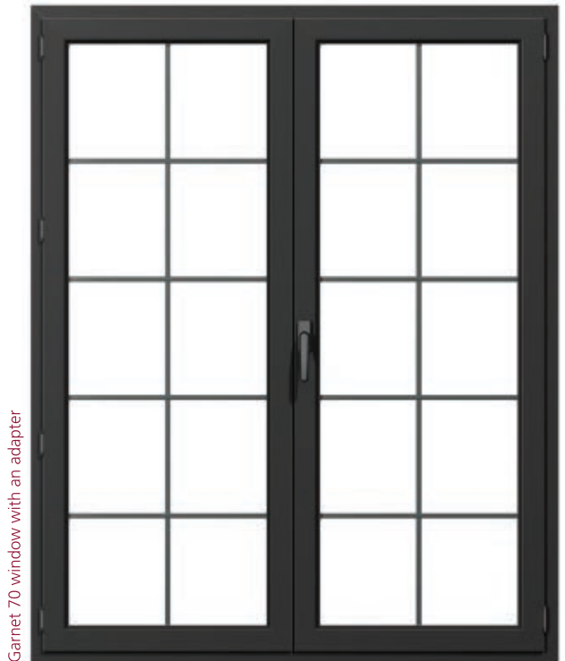
Garnet 70 window with an adapter