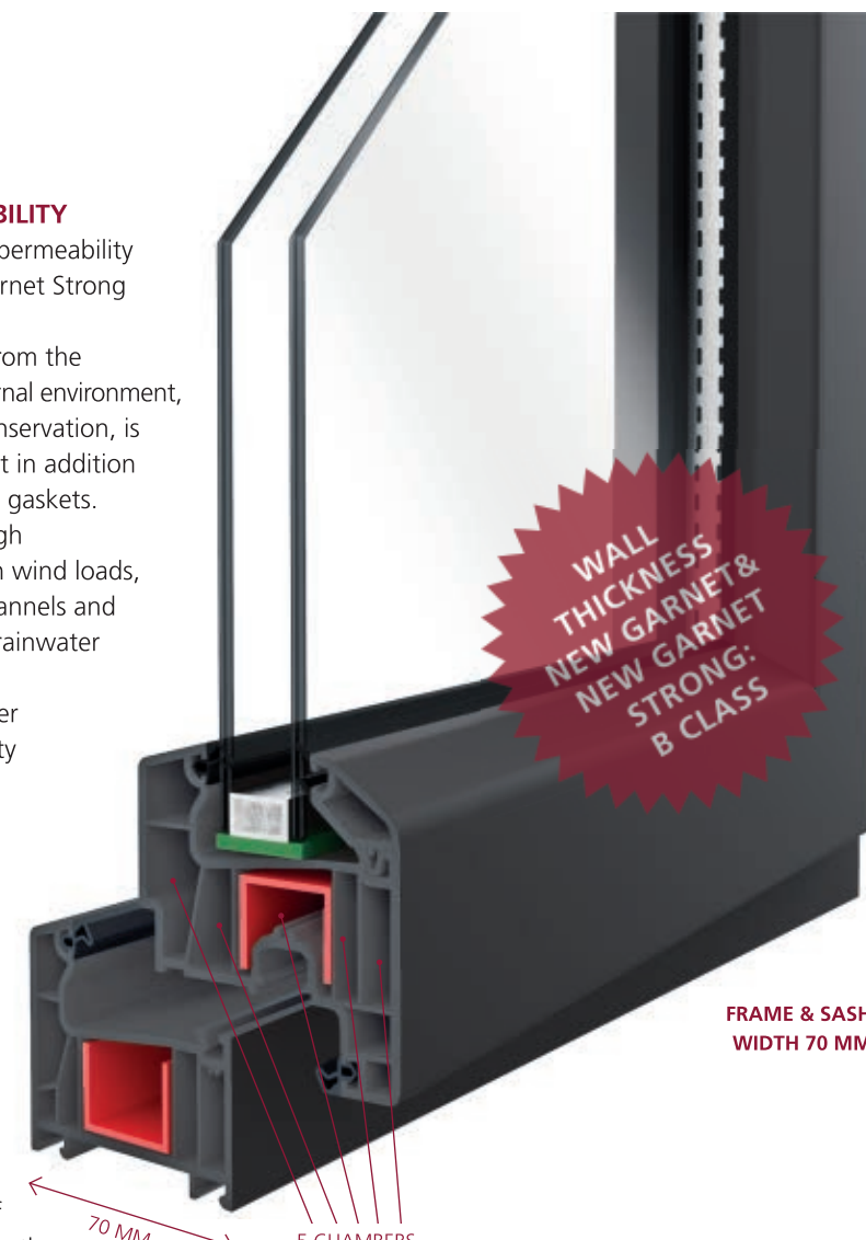
FRAME & SASH WIDTH 70 MM

One of the most important criteria in window systems is the sound insulation. High sound levels about 70 dB in the areas close to airports, railways or crowded highways are decreased to values under 30 dB which a child can sleep easily by with the New Garnet and New Garnet Strong systems. Sound insulation up to 40 dB value can be provided with New Garnet and New Garnet Strong series. Therefore, it is possible to create a sound environment at a high quality life level even at the loudest places.