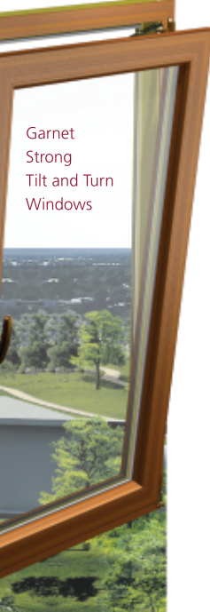
Garnet Strong Tilt and Turn Windows