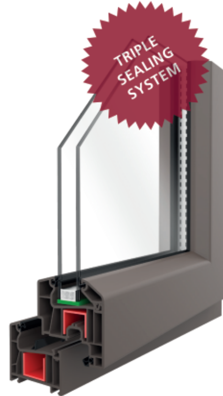
TRIPLE SEALING SYSTEM